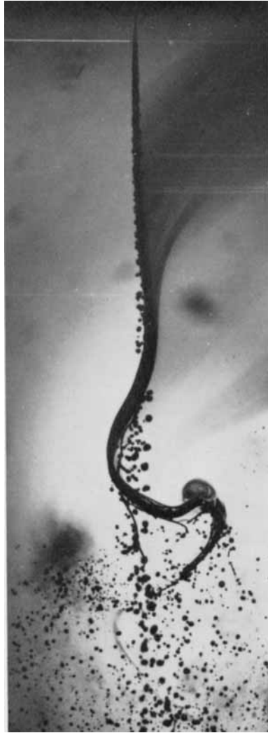
FIGURE 4. Vortex growth on high velocity liquid sheet. ( 2.5\times magnification.)