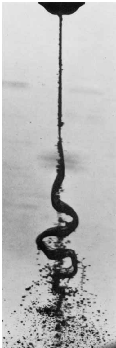
FIGURE 2. Wave growth on low velocity liquid sheet. ( 2.5\times magnification.)